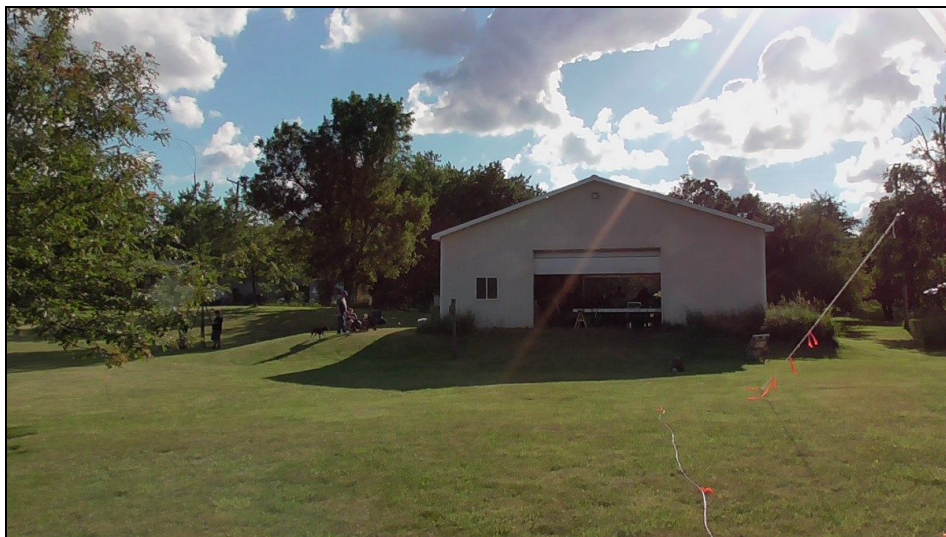
A sheltered operating area; notice the flagged guy lines and coax run.