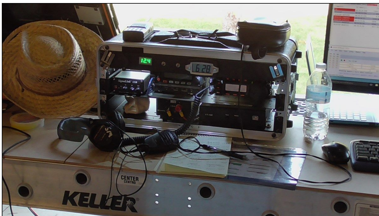
Will, KB8YGA's setup is very compact, fitting neatly into this audio rack case.