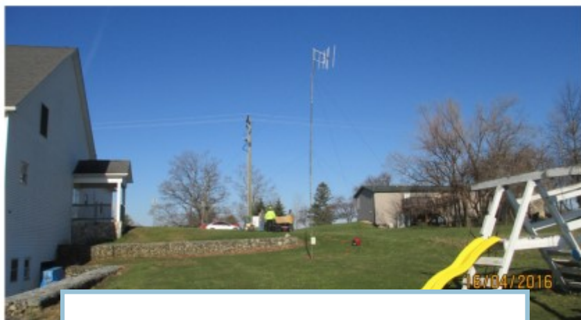
Overall layout, with the mast, generator, and operating station in the background.

Your Lapeer County ARES team participated in the Lapeer County Simulated Emergency Test (SET) on April 16th. The scenario this year was a direct tornado hit at a Baptist Church on M-53 north of Imlay City. In addition to the disaster zone, a Red Cross shelter was established at the Goodland Township Methodist Church, also on M-53 just north of Imlay City.