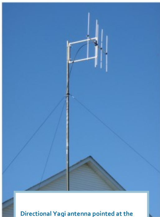
Directional Yagi antenna pointed at the McLaren Hospital site. Digital communications were possible even with 5 watts of power.