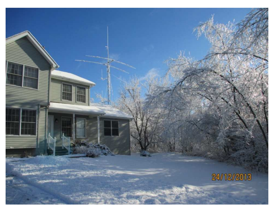
It is a little hard to see but the bent trees on the right side of the photo are threatening the G5RV. It held until the melt and still works.