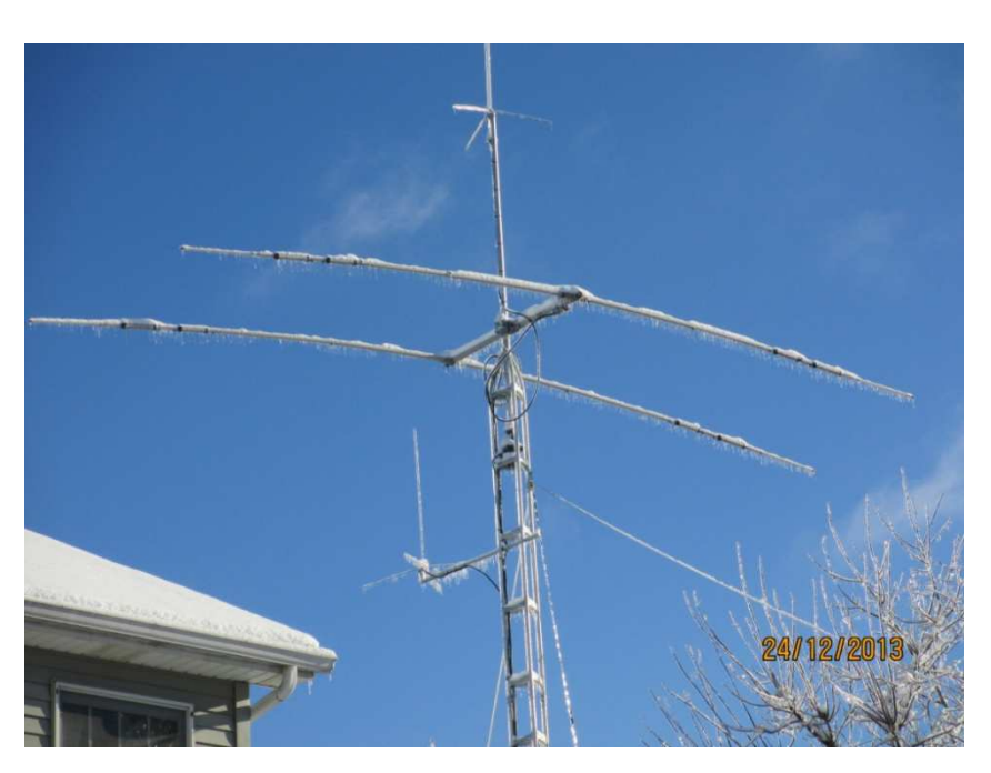
The yagi bending a little under the weight.