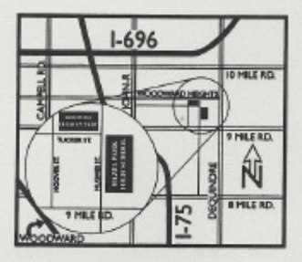
23400 Hughes . Hazel Park, MI

January 16, 2011 - 8:00 AM til 12:00 NOON W8HP - Talk-in 146.640(100hz.pl) D.A.R.T. Repeater Tables $15.00 TICKETS $5.00 Plenty of Free Parking Vendor Setup: 6AM WITH PAID ADMISSION