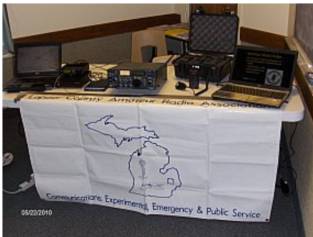
The LCARA display at the LDS Church preparedness fair display