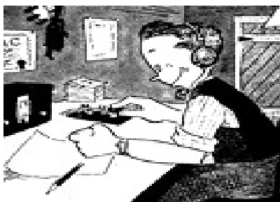
K8DD Multi Op station on 160 CW

The next major contest is the third weekend this month—the ARRL International DX CW Contest. DX stations work only US and Canada. The exchange is a signal report and state for US and VE and DX gives a signal report and their power output.